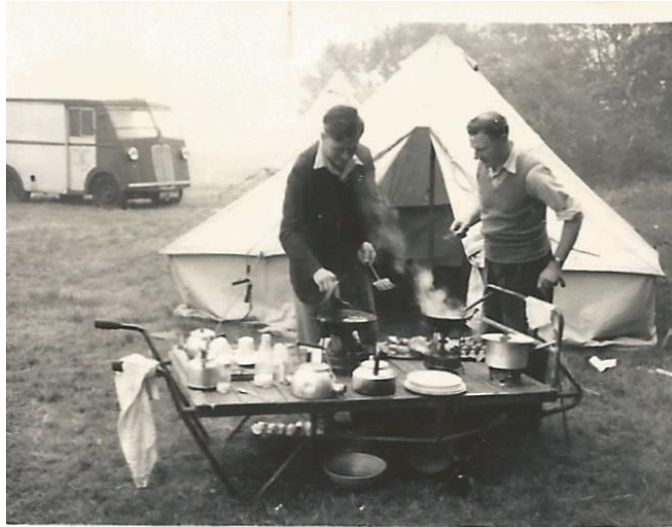
WKARS field day cooking, some time mid-1950s.