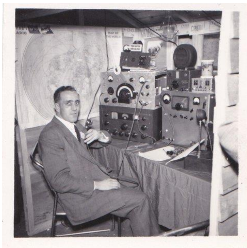
The WKRS stand at the Tunbridge Wells Hobby Exhibition. It is not known on which year in the 1950s this photograph was taken